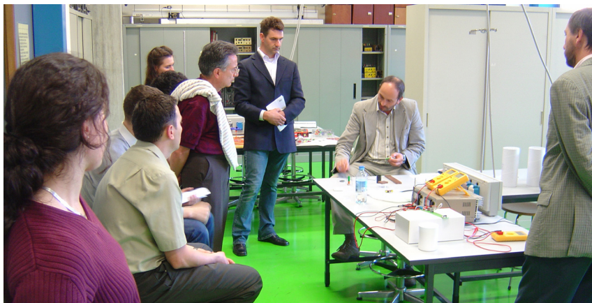
Project meeting in Udine, Italy, where we are discussing learning activities related to magnetism