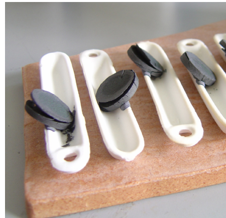
Superconducting pellets produced at the University of Munich for testing at teacher seminars, etc.