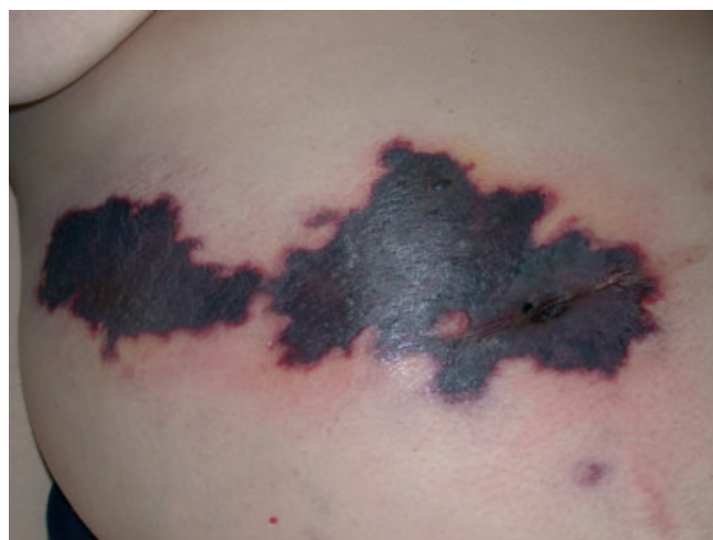
Figure 3. Coumarin-associated skin necrosis in a patient with protein C deficiency.

platelets. Thromboembolic events occur in more than 50% of patients. Low-molecular weight heparin-induced skin necrosis may occur as part of HIT syndrome, but other factors, such as local trauma, may also be involved (20). Disseminated thrombosis of vessels in the skin and in other organs is called white clot syndrome. Clinically hemorrhagic, sometimes bullous lesions and plaques with rapid evolution toward necrosis are present. Rarely sclerodermiform lesions have been described. Lesions may be present at the injection site or at distant locations and may cause thrombosis in organs, such as the central nervous system and the kidneys.