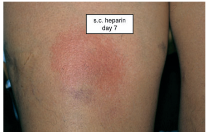
Figure 1. Heparin-induced delayed erythematous plaque at day 7 after subcutaneous injection.

The main differential diagnoses include local hematoma, infections, such as erysipelas, contact dermatitis