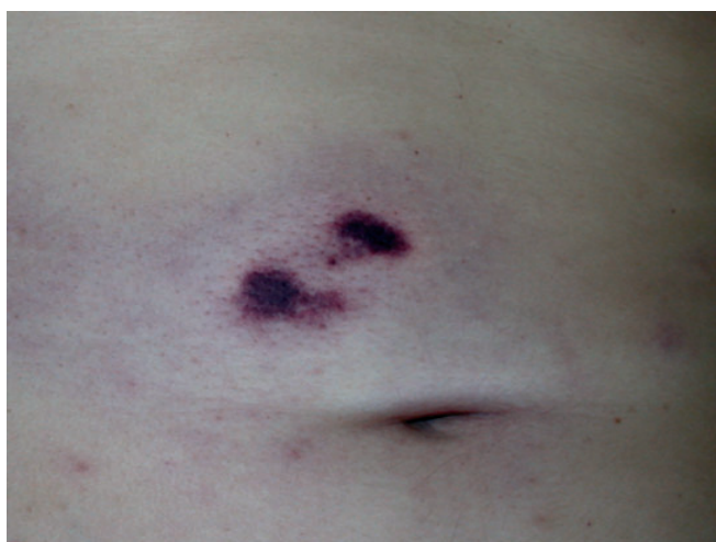
Figure 2. Heparin-induced skin necrosis in heparin-induced thrombocytopenia II.

Heparin necrosis (Fig. 2) looks clinically very similar to coumarin necrosis (Fig. 3). It may initially be confounded with plaques in cell-mediated hypersensitivity (9, 17). Heparin necrosis is the cutaneous manifestation of the severe form of HIT II. Heparin-induced thrombocytopenia II occurs in about 1–4% of patients treated with UF-heparin. Surgical patients are at highest risk. A lower risk is present during treatment with LMWH as well as in pediatric patients. Clinical definition of HIT II is an acquired platelet count of < 100 000 or a 50% decrease from baseline values, occurring 5–10 days after initiation of heparin therapy in the absence of another etiology. This means that some patients with HIT II have platelet counts still within the normal range, but lower than the preheparin exposure baseline (19). Heparin-induced thrombocytopenia II begins typically after 6–8 days of treatment. It is characterized by a sudden decrease of