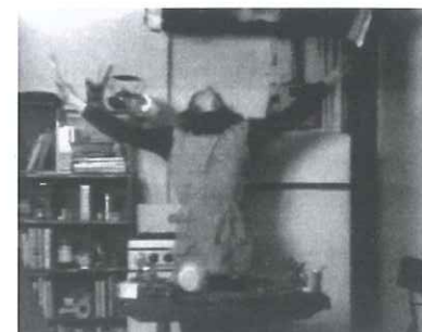
Martha Rosler, Semiotics of the Kitchen , 1975 Courtesy of Electronic Arts Intermix (EAI), New York ( http://www.eai.org )

local Institutos de la Mujer, which tended to organize exhibitions whose sole nexus was the biological sex of the participants, thesis exhibitions, many of them feminist in affiliation, started to be programmed to take strategic and not wholly disinterested advantage of the March date. 14 However, not even this favorable opportunity helped to draw attention back to the seventies. Before the role of these woman artists can be evaluated, therefore, we still need a full account of who did what, and where and how. Only in this way can we produce a reinterpretation of history with a view to completing it. While such studies are lacking, even though some research in this direction is slowly starting to appear, it seems reasonable