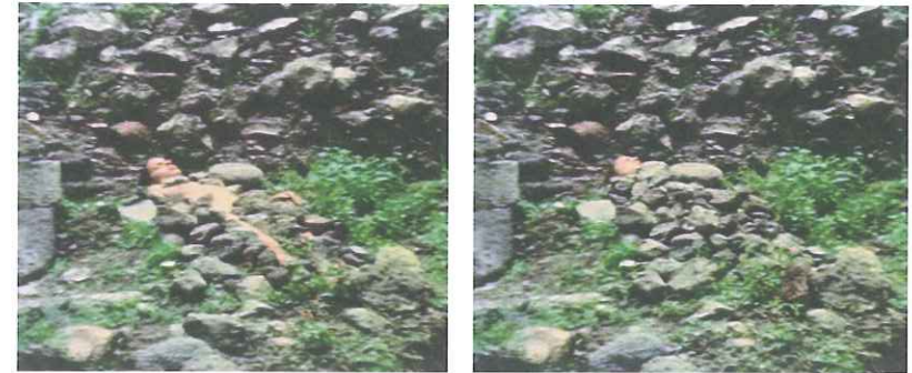
Ana Mendieta. Burial Pyramide , Yagul, México, 1974