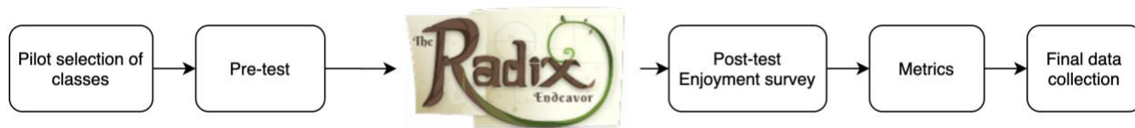
Figure 1. Overview of the methodology pursued in this study.

In this section of the chapter, we describe the methodology that we have pursued to analyze the interplay between in-game metrics, enjoyment and learning gains. Figure 1 shows an overview of the methodology that we will describe in detail in the following different subsections.