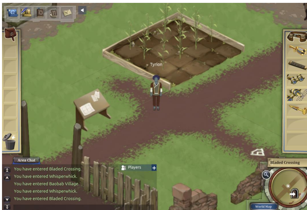
Figure 2. Example of the interface of Radix.