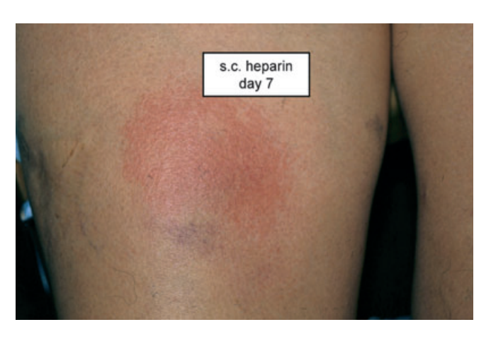
Figure 1. Heparin-induced delayed erythematous plaque at day 7 after subcutaneous injection.

The main differential diagnoses include local hematoma, infections, such as erysipelas, contact dermatitis