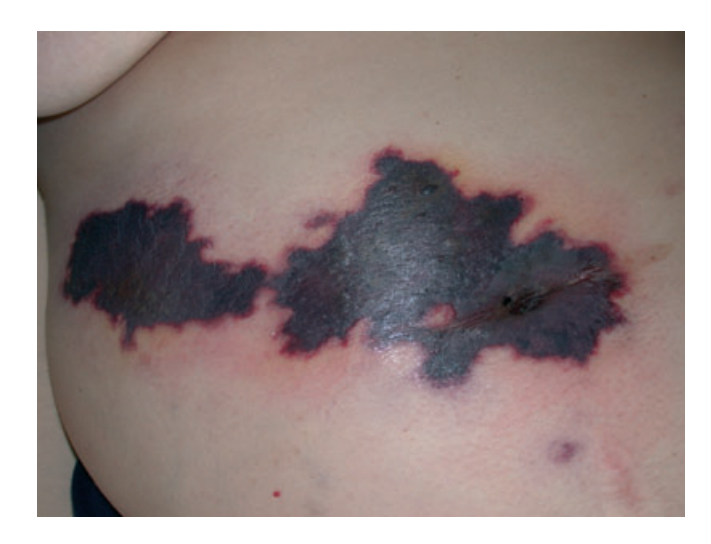
Figure 3. Coumarin-associated skin necrosis in a patient with protein C deficiency.

platelets. Thromboembolic events occur in more than 50% of patients. Low-molecular weight heparin-induced skin necrosis may occur as part of HIT syndrome, but other factors, such as local trauma, may also be involved (20). Disseminated thrombosis of vessels in the skin and in other organs is called white clot syndrome. Clinically hemorrhagic, sometimes bullous lesions and plaques with rapid evolution toward necrosis are present. Rarely sclerodermiform lesions have been described. Lesions may be present at the injection site or at distant locations and may cause thrombosis in organs, such as the central nervous system and the kidneys.