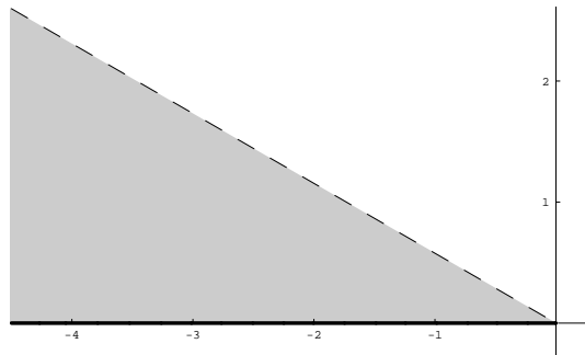
FIGURE 1. Roots of 3-dimensional Steiner polynomials in the upper half plane.

In particular, we note that the set \mathcal{R}(2, E) , as well as the closure of \mathcal{R}(3, E) , are independent of the gauge body E . It seems to be quite likely